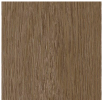
Pediment Oak PRX206