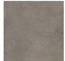
Antler Velvet PRX301