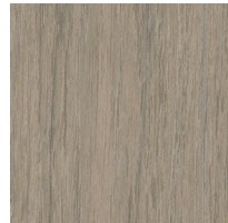
Lichen Oak PRX205