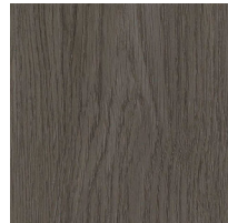
Mink Oak PRX203