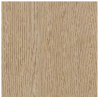
Andara Oak PRX204