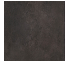
Vellum Smoke PRX302

Construction.....Polymeric Composite Non-Vinyl Flooring Sizes.....7.25" x 48" (Wood), 18" x 18" (Stone) Total Thickness.....0.100" (2.5 mm) Wear Layer Thickness...20 mil (0.51 mm) Wear Layer.....Quantum Guard Elite®