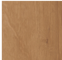
Sunbaked Oak PRX201