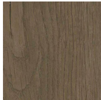
Grounding Oak PRX202